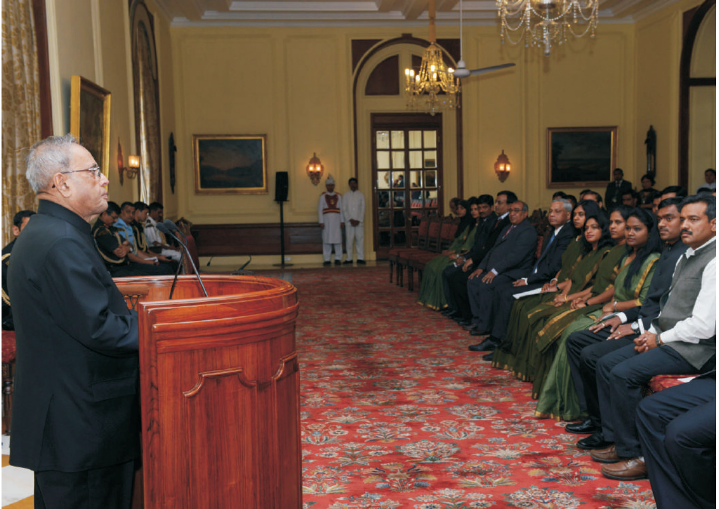
Hon'ble President of India Shri Pranab Mukherjee addressing the ICAS officers

it is imperative for government departments to modernize their systems and make them citizen-centric. He said that he was happy that the reforms introduced by the organization were in the correct direction.