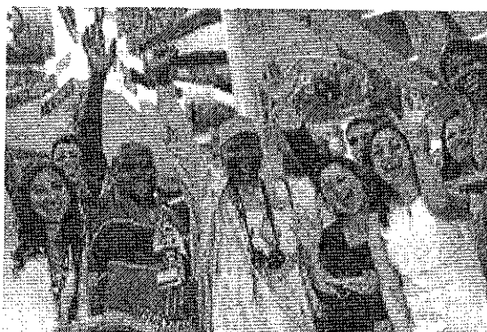
IPDET flyer 2018 (PDF, 178KB)